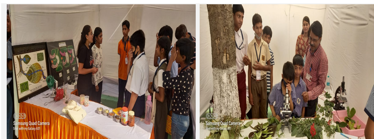
Students' Training at NEERI, Nagpur organized by VIGYAN BHARTI and NEERI

This program essentially needs Industrial visits, training modules, dissertation and students need to participate.