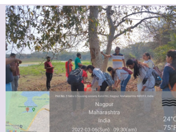
Nature Walk : Seed collection at Gorewada