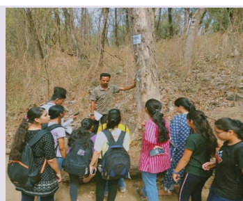
Insect Walk at Seminary Hills

This program essentially needs Industrial visits, training modules, dissertation and students need to participate.