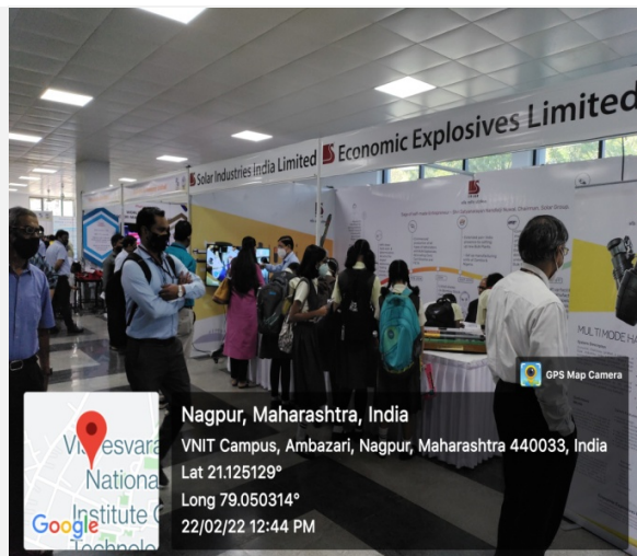
Visit to VNIT Exhibition "Vidhnyan Sarvatra Pujyate" organized by Vigyan Bharti

This program essentially needs Industrial visits, training modules, dissertation and students need to participate.