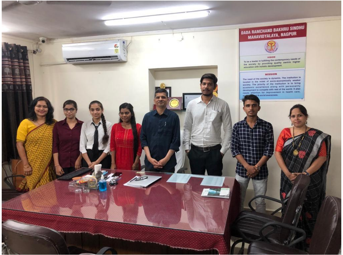
Students selected in ICICI Prudential 2022 Online webinar on the topic “Campus to Corporate”