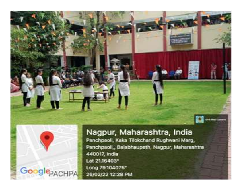
STREET PLAY ON BAN ON PLASTICS