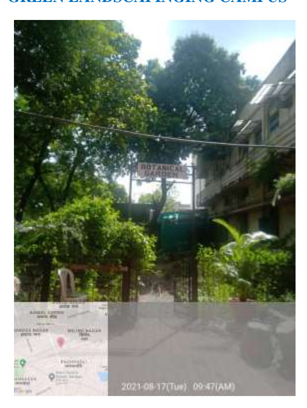
BOTANICAL GARDEN AT CAMPUS