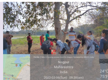
Nature Walk : Seed collection at Gorewada