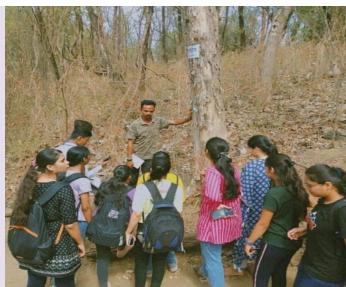
Insect Walk at Seminary Hills