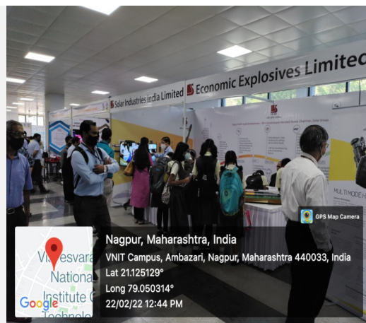
Visit to VNIT Exhibition "Vidhnyan Sarvatra Pujyate" organized by Vigyan Bharti