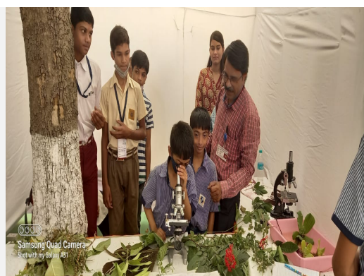
Students' Training at NEERI, Nagpur organized by VIGYAN BHARTI and NEERI