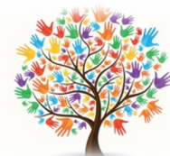
Holistic Educational Institute