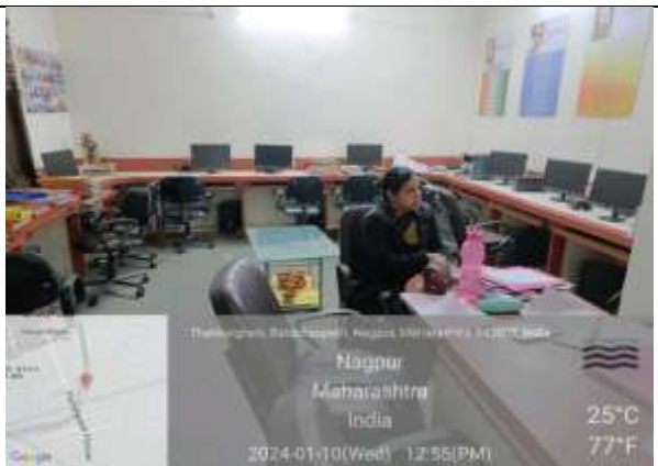
DIGITAL READING ROOM