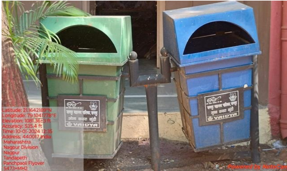
Green and blue color dustbins for collection of dry and wet solid waste.