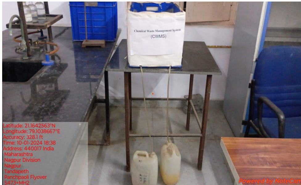
Filter assembly to reduce chemical waste (chemistry Lab)