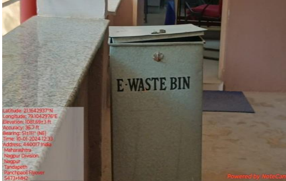
E-waste bin installed in college.

A premier higher education linguistic minority institutes run by Sindhi Hindi Vidya Samiti