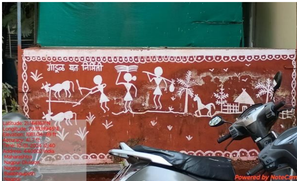
Vermi-compost Unit for biodegradable solid waste