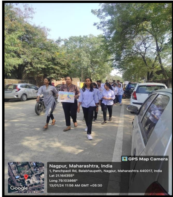
Students took part in rally to aware the people about consequence of using Chinese manja