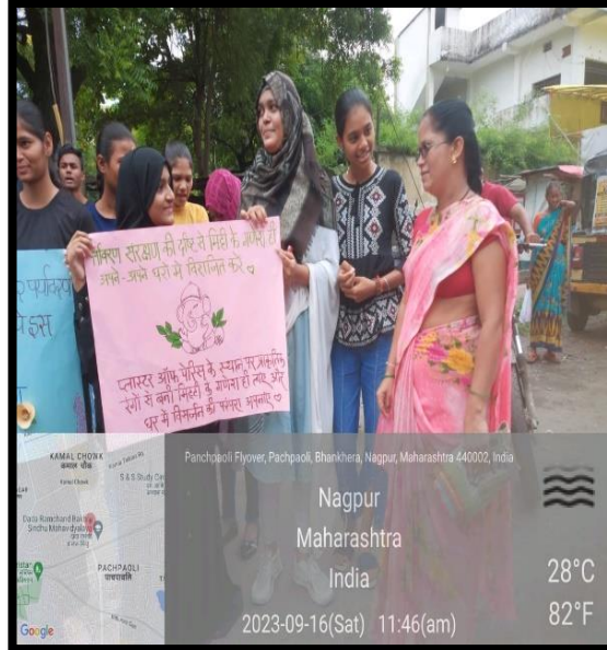
Students are making the posters for event