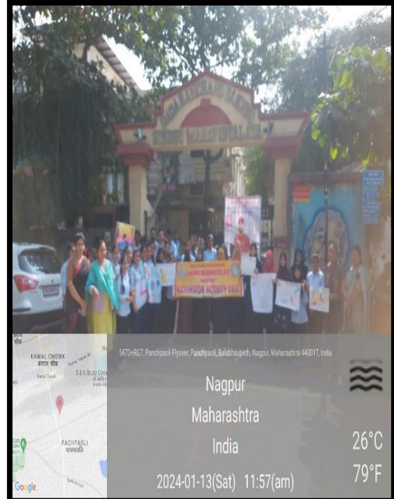
Teachers and students at the event