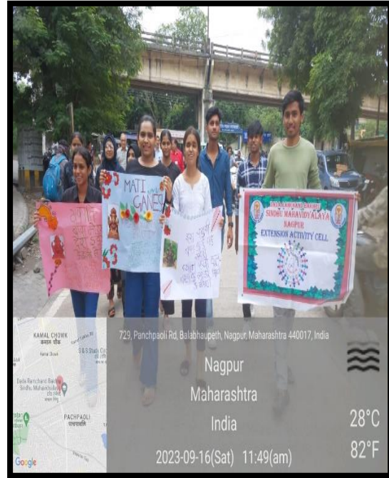
Students explaining the importance of Eco-Ganesha Ganesha