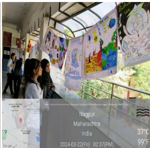
Students observing posters